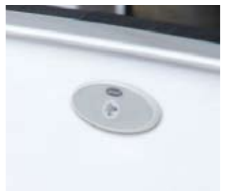
The Jacuzzi Magic Touch<sup>®</sup> control system makes customizing your bath easy.

Riva<sup>®</sup> 5 PURE AIR<sup>®</sup> II BATH